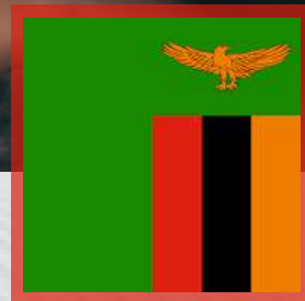
Host Country Zambia