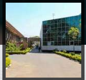
Host Venue Mulungushi International Conference Centre